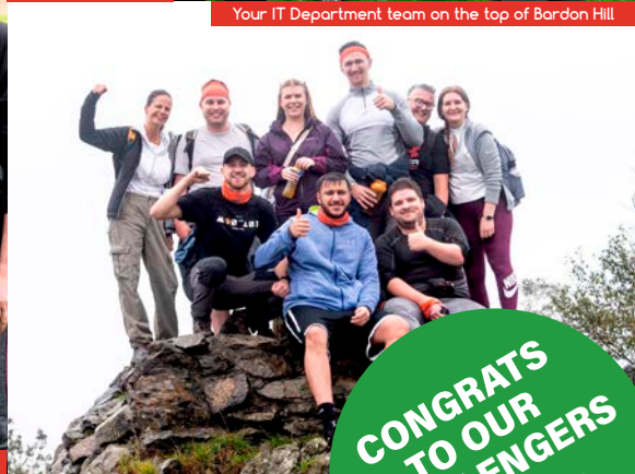
Your IT Department team on the top of Bardon Hill

CONGRATS TO OUR CHALLENGERS You are all amazing!