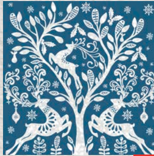
Reindeer (x10 per pack)