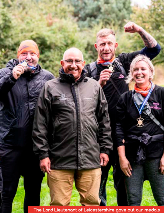
The Lord Lieutenant of Leicestershire gave out our medals