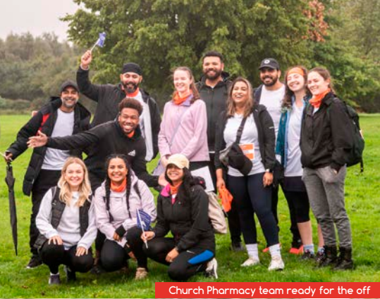
Church Pharmacy team ready for the off