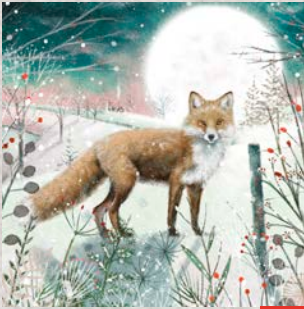
Fox (x10 per pack)

Buy online or get in touch to purchase. Tel: 0116 222 2200 or hello@charity-link.org