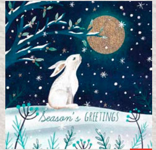
Hare (x10 per pack)