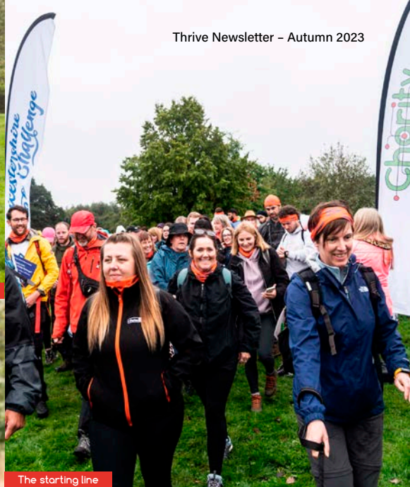
The starting line